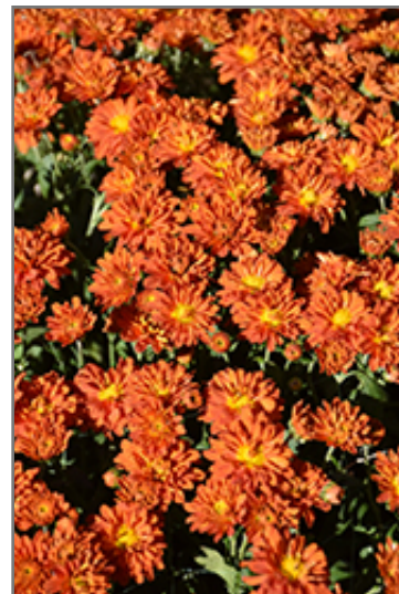
Padre Orange Chrysanthemum flowers

Padre Orange Chrysanthemum will grow to be about 18 inches tall at maturity, with a spread of 20 inches. It grows at a medium rate, and under ideal conditions can be expected to live for approximately 10 years. As an herbaceous perennial, this plant will usually die back to the crown each winter, and will regrow from the base each spring. Be careful not to disturb the crown in late winter when it may not be readily seen!