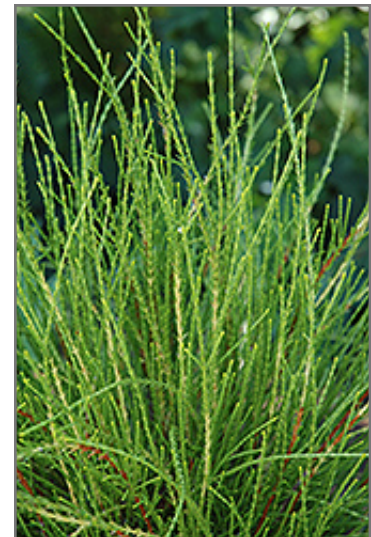
Franky Boy Arborvitae foliage