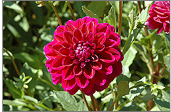
Boogie Nights Dahlia flowers