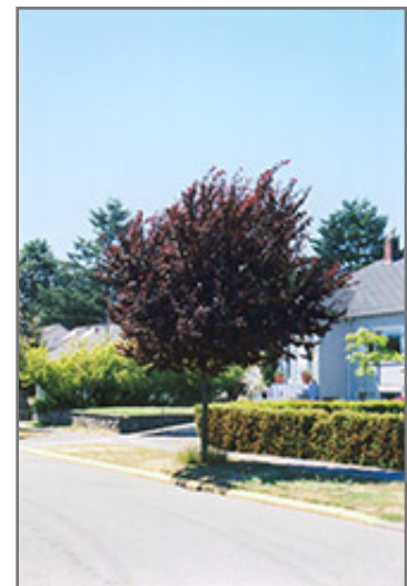
Newport Plum