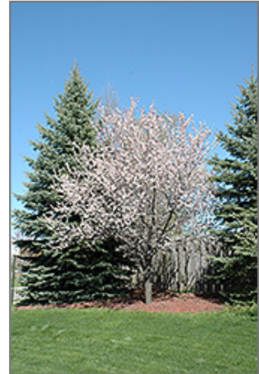
Newport Plum in bloom

This tree should only be grown in full sunlight. It does best in average to evenly moist conditions, but will not tolerate standing water. It is not particular as to soil type or pH. It is highly tolerant of urban pollution and will even thrive in inner city environments. This is a selected variety of a species not originally from North America.