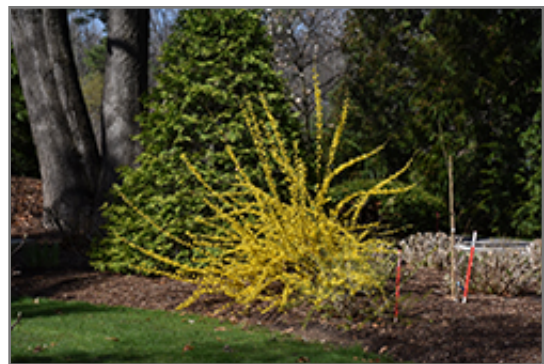
Show Off Forsythia in bloom