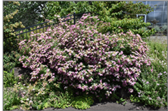
Lemon Princess Spirea in bloom

This shrub should only be grown in full sunlight. It prefers to grow in average to moist conditions, and shouldn't be allowed to dry out. It is not particular as to soil type or pH. It is highly tolerant of urban pollution and will even thrive in inner city environments. This is a selected variety of a species not originally from North America.