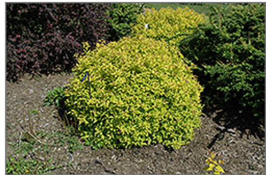
Lemon Princess Spirea