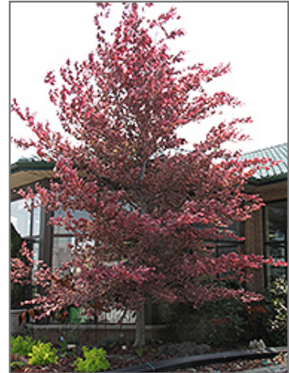
Tricolor Beech