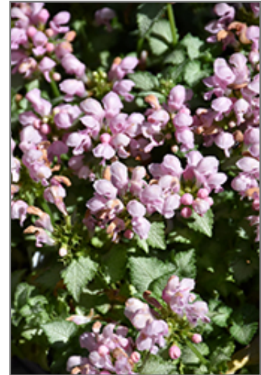
Pink Pewter Spotted Dead Nettle flowers