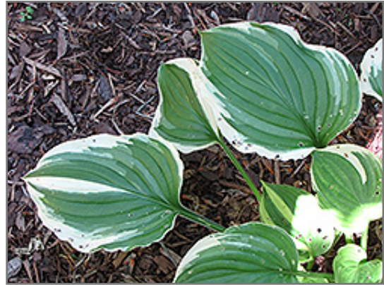
Gold-Variegated Blue Plantain Lily foliage