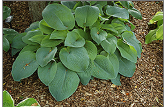
True Blue Hosta