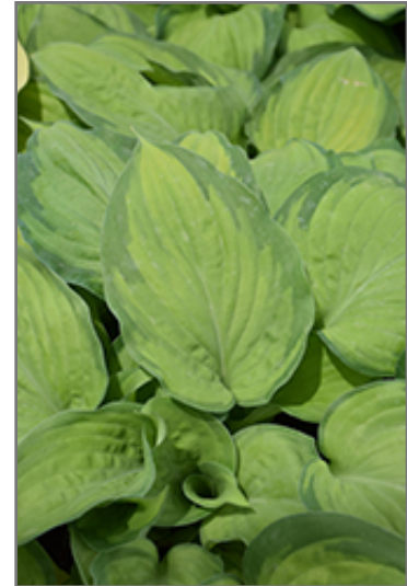
Paradigm Hosta foliage

This plant does best in partial shade to shade. It prefers to grow in average to moist conditions, and shouldn't be allowed to dry out. It is not particular as to soil type or pH. It is somewhat tolerant of urban pollution. This particular variety is an interspecific hybrid. It can be propagated by division; however, as a cultivated variety, be aware that it may be subject to certain restrictions or prohibitions on propagation.