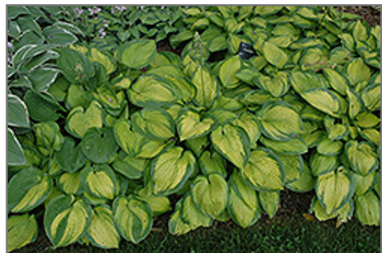
Paradigm Hosta