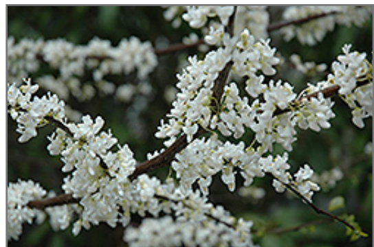
White Redbud flowers