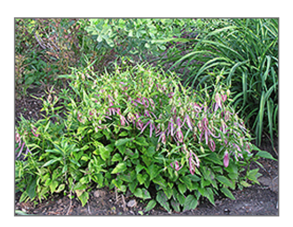
Pink Octopus Bellflower in bloom

Pink Octopus Bellflower is recommended for the following landscape applications;