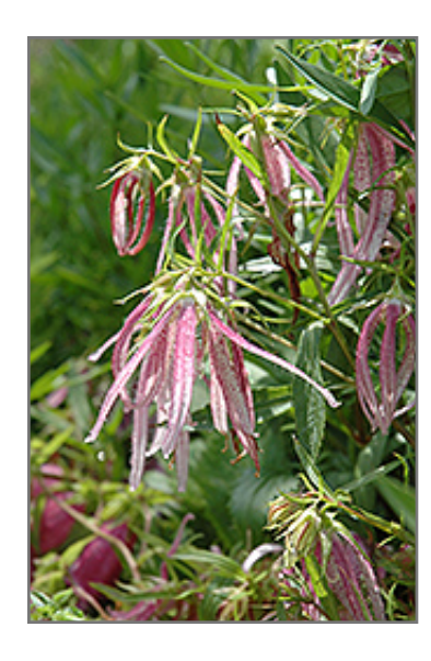
Pink Octopus Bellflower flowers