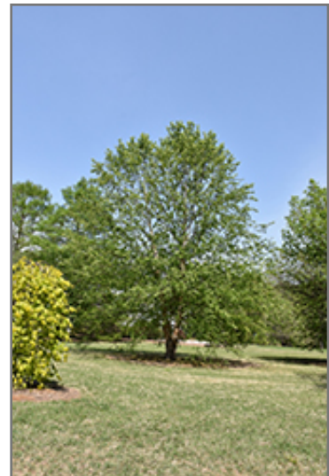
Dura Heat River Birch