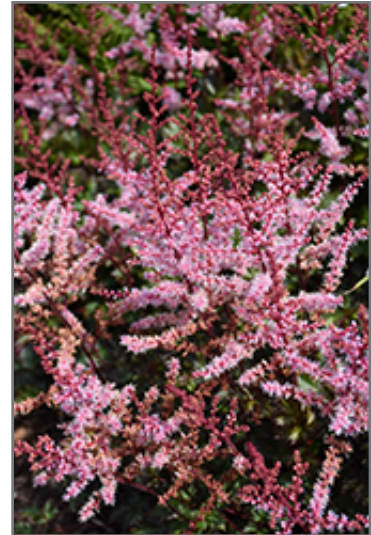
Delft Lace Astilbe flowers

This is a relatively low maintenance plant, and is best cleaned up in early spring before it resumes active growth for the season. It is a good choice for attracting butterflies to your yard, but is not particularly attractive to deer who tend to leave it alone in favor of tastier treats. It has no significant negative characteristics.