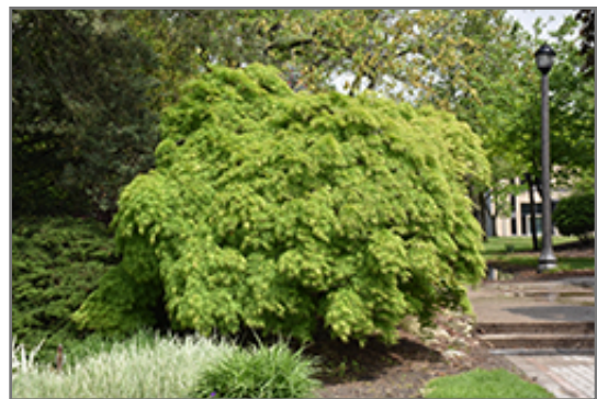
Cutleaf Japanese Maple