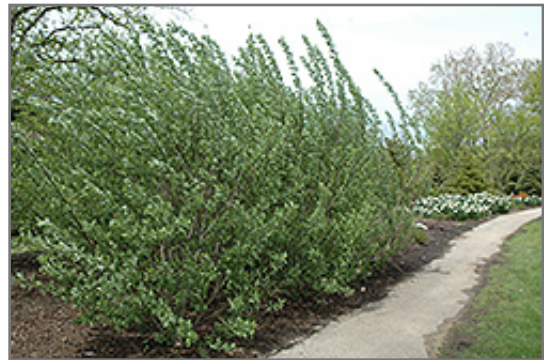
French Pussy Willow