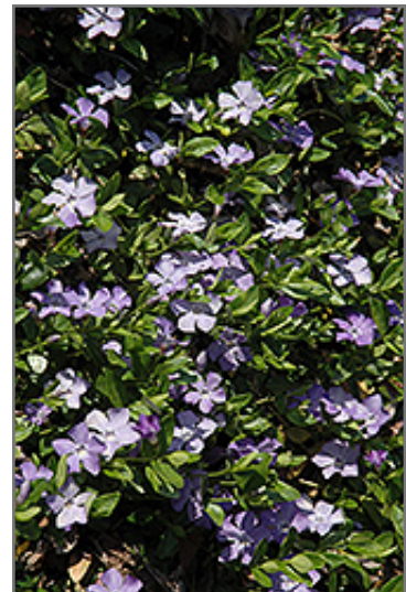
Common Periwinkle in bloom