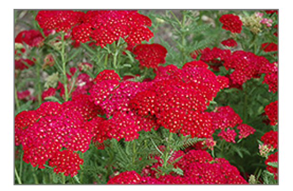
Pomegranate Yarrow flowers