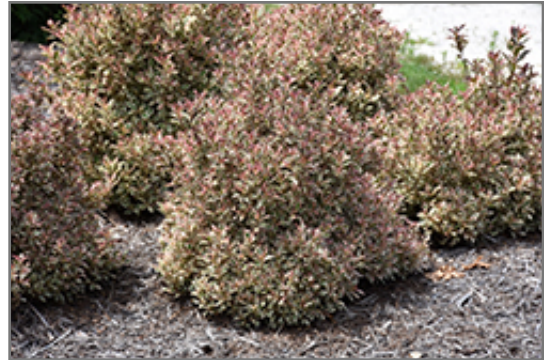
My Monet Weigela

My Monet Weigela makes a fine choice for the outdoor landscape, but it is also well-suited for use in outdoor pots and containers. It is often used as a 'filler' in the 'spiller-thriller-filler' container combination, providing a mass of flowers and foliage against which the thriller plants stand out. Note that when grown in a container, it may not perform exactly as indicated on the tag - this is to be expected. Also note that when growing plants in outdoor containers and baskets, they may require more frequent waterings than they would in the yard or garden.