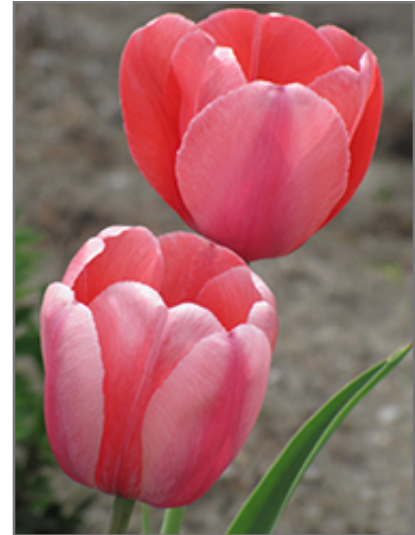
Pink Impression Tulip flowers