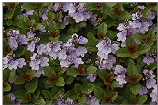
Waterperry Blue Speedwell flowers