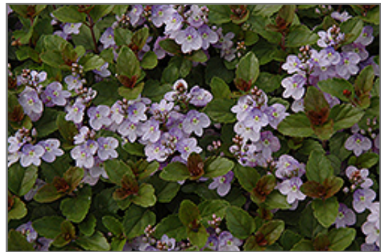
Waterperry Blue Speedwell flowers