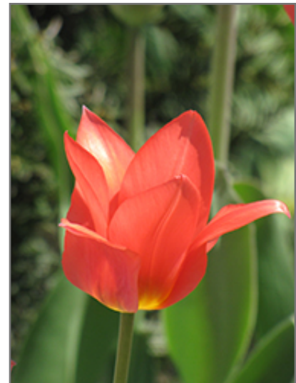
Red Emperor Tulip flowers