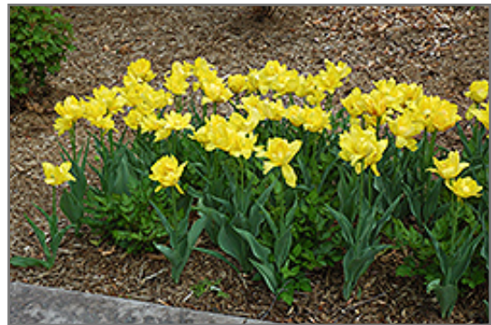
Monte Carlo Tulip in bloom