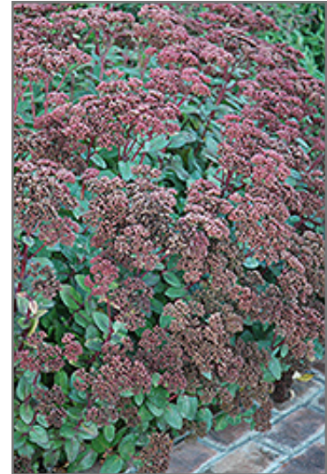
Matrona Stonecrop flowers

Matrona Stonecrop is recommended for the following landscape applications;