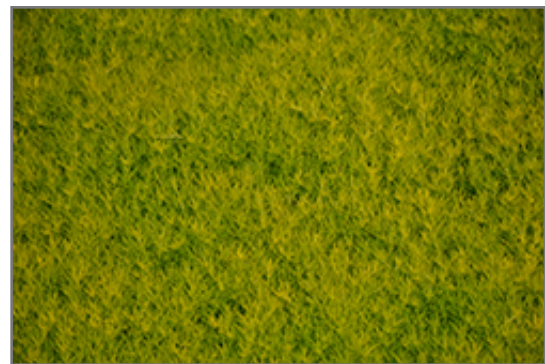
Scotch Moss foliage