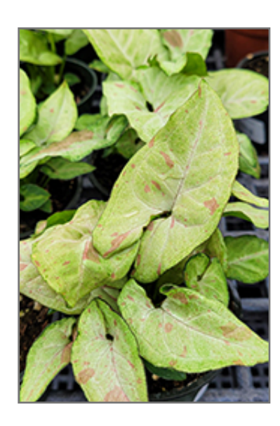
Confetti Arrowhead Vine foliage

When grown indoors, Confetti Arrowhead Vine can be expected to grow to be about 14 inches tall at maturity, with a spread of 8 feet. It grows at a fast rate, and under ideal conditions can be expected to live for approximately 10 years. This houseplant performs well in both bright or indirect sunlight and strong artificial light, and can therefore be situated in almost any well-lit room or location. It prefers to grow in average to moist soil. The surface of the soil shouldn't be allowed to dry out completely, and so you should expect to water this plant once and possibly even twice each week. Be aware that your particular watering schedule may vary depending on its location in the room, the pot size, plant size and other conditions; if in doubt, ask one of our experts in the store for advice. It is not particular as to soil pH, but grows best in rich soil. Contact the store for specific recommendations on pre-mixed potting soil for this plant. Be warned that parts of this plant are known to be toxic to humans and animals, so special care should be exercised if growing it around children and pets.