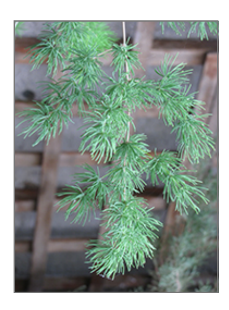
Myriocladus Asparagus Fern foliage

When grown indoors, Myriocladus Asparagus Fern can be expected to grow to be about 5 feet tall at maturity, with a spread of 3 feet. It grows at a medium rate, and under ideal conditions can be expected to live for approximately 20 years. This houseplant performs well in both bright or indirect sunlight and strong artificial light, and can therefore be situated in almost any well-lit room or location. It is very adaptable to both dry and moist soil, but will not tolerate any standing water. The surface of the soil shouldn't be allowed to dry out completely, and so you should expect to water this plant once and possibly even twice each week. Be aware that your particular watering schedule may vary depending on its location in the room, the pot size, plant size and other conditions; if in doubt, ask one of our experts in the store for advice. It is not particular as to soil pH, but grows best in rich soil. Contact the store for specific recommendations on pre-mixed potting soil for this plant.