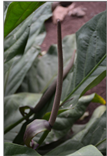
Pheasant's Tail flowers