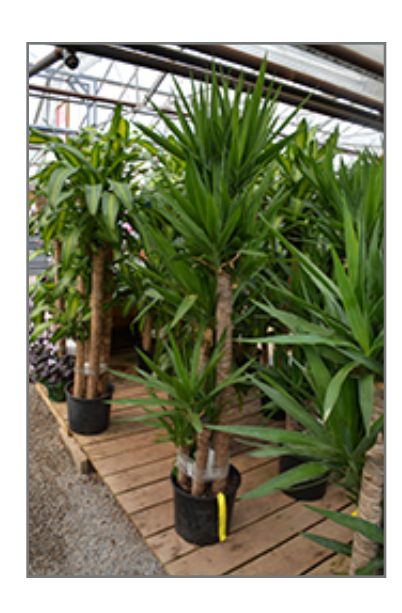
Spineless Yucca

When grown indoors, Spineless Yucca can be expected to grow to be about 4 feet tall at maturity, with a spread of 4 feet. It grows at a slow rate, and under ideal conditions can be expected to live for approximately 20 years. This houseplant requires direct sun for optimal performance, and should therefore be situated in a room that gets bright sunlight for a good part of the day; it is not a good choice for rooms lit only by artificial light. It prefers dry to average moisture levels with very well-drained soil, and may die if left in standing water for any length of time. This plant should be watered when the surface of the soil gets dry, and will need watering approximately once each week. Be aware that your particular watering schedule may vary depending on its location in the room, the pot size, plant size and other conditions; if in doubt, ask one of our experts in the store for advice. It is not particular as to soil pH, but grows best in sandy soil. Contact the store for specific recommendations on pre-mixed potting soil for this plant.