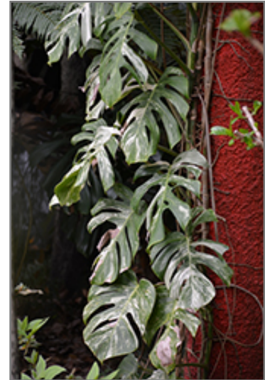
Thai Constellation Monstera

When grown indoors, Thai Constellation Monstera can be expected to grow to be about 16 feet tall at maturity, with a spread of 4 feet. It grows at a medium rate, and under ideal conditions can be expected to live for approximately 20 years. This houseplant performs well in both bright or indirect sunlight and strong artificial light, and can therefore be situated in almost any well-lit room or location. It does best in average to evenly moist soil, but will not tolerate standing water. The surface of the soil shouldn't be allowed to dry out completely, and so you should expect to water this plant once and possibly even twice each week. Be aware that your particular watering schedule may vary depending on its location in the room, the pot size, plant size and other conditions; if in doubt, ask one of our experts in the store for advice. It is not particular as to soil type or pH; an average potting soil should work just fine. Be warned that parts of this plant are known to be toxic to humans and animals, so special care should be exercised if growing it around children and pets.