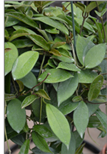
Wax Plant foliage

When grown indoors, Wax Plant can be expected to grow to be about 10 inches tall at maturity, with a spread of 4 feet. It grows at a medium rate, and under ideal conditions can be expected to live for approximately 10 years. This houseplant performs well in both bright or indirect sunlight and strong artificial light, and can therefore be situated in almost any well-lit room or location. It is very adaptable to both dry and moist soil, but will not tolerate any standing water. The surface of the soil shouldn't be allowed to dry out completely, and so you should expect to water this plant once and possibly even twice each week. Be aware that your particular watering schedule may vary depending on its location in the room, the pot size, plant size and other conditions; if in doubt, ask one of our experts in the store for advice. It is particular about its soil conditions, with a strong preference for rich, acidic soil. Contact the store for specific recommendations on pre-mixed potting soil for this plant.