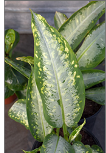
Panther Dieffenbachia foliage

When grown indoors, Panther Dieffenbachia can be expected to grow to be about 5 feet tall at maturity, with a spread of 3 feet. It grows at a medium rate, and under ideal conditions can be expected to live for approximately 10 years. This houseplant performs well in both bright or indirect sunlight and strong artificial light, and can therefore be situated in almost any well-lit room or location. It does best in average to evenly moist soil, but will not tolerate standing water. The surface of the soil shouldn't be allowed to dry out completely, and so you should expect to water this plant once and possibly even twice each week. Be aware that your particular watering schedule may vary depending on its location in the room, the pot size, plant size and other conditions; if in doubt, ask one of our experts in the store for advice. It is not particular as to soil type or pH; an average potting soil should work just fine. Be warned that parts of this plant are known to be toxic to humans and animals, so special care should be exercised if growing it around children and pets.