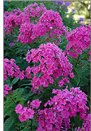
Eva Cullum Garden Phlox flowers