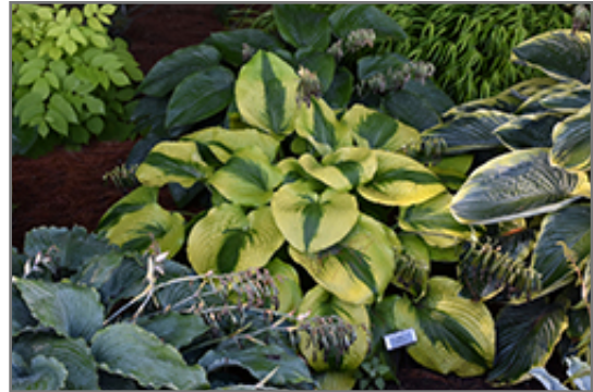
Afterglow Hosta