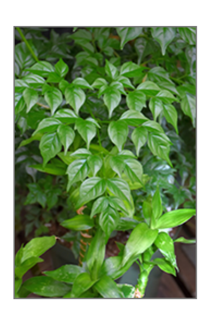
China Doll foliage

There are many factors that will affect the ultimate height, spread and overall performance of a plant when grown indoors; among them, the size of the pot it's growing in, the amount of light it receives, watering frequency, the pruning regimen and repotting schedule. Use the information described here as a guideline only; individual performance can and will vary. Please contact the store to speak with one of our experts if you are interested in further details concerning recommendations on pot size, watering, pruning, repotting, etc.