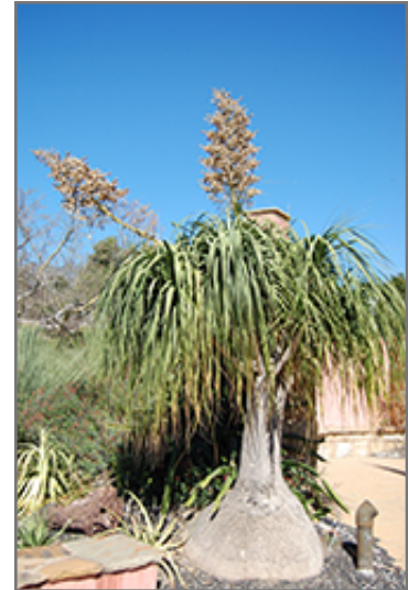
Pony Tail Palm in bloom

When grown indoors, Pony Tail Palm can be expected to grow to be about 7 feet tall at maturity, with a spread of 4 feet. It grows at a slow rate, and under ideal conditions can be expected to live for approximately 80 years. This houseplant will do well in a location that gets either direct or indirect sunlight, although it will usually require a more brightly-lit environment than what artificial indoor lighting alone can provide. It prefers dry to average moisture levels with very well-drained soil, and may die if left in standing water for any length of time. This plant should be watered when the surface of the soil gets dry, and will need watering approximately once each week. Be aware that your particular watering schedule may vary depending on its location in the room, the pot size, plant size and other conditions; if in doubt, ask one of our experts in the store for advice. It is not particular as to soil pH, but grows best in sandy soil. Contact the store for specific recommendations on pre-mixed potting soil for this plant.