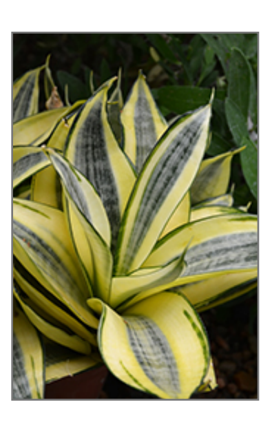
Golden Hahnii Snake Plant

When grown indoors, Golden Hahnii Snake Plant can be expected to grow to be about 8 inches tall at maturity, with a spread of 18 inches. It grows at a slow rate, and under ideal conditions can be expected to live for approximately 10 years. This houseplant performs well in both bright or indirect sunlight and strong artificial light, and can therefore be situated in almost any well-lit room or location. It is very adaptable to both dry and moist soil, but will not tolerate any standing water. The surface of the soil shouldn't be allowed to dry out completely, and so you should expect to water this plant once and possibly even twice each week. Be aware that your particular watering schedule may vary depending on its location in the room, the pot size, plant size and other conditions; if in doubt, ask one of our experts in the store for advice. It is not particular as to soil pH, but grows best in sandy soil. Contact the store for specific recommendations on pre-mixed potting soil for this plant.