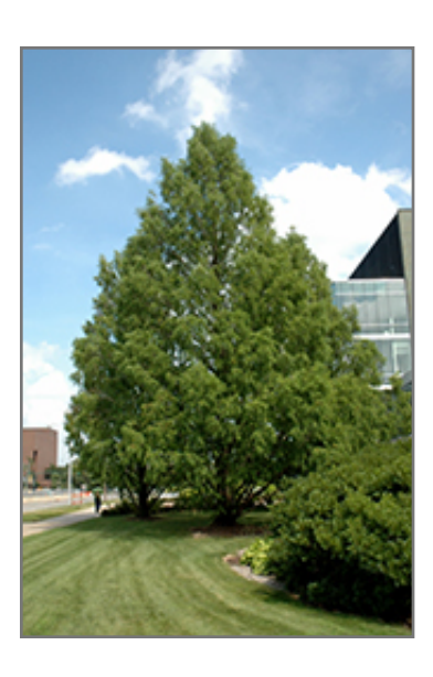
Dawn Redwood