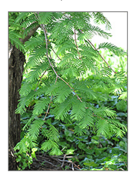
Dawn Redwood foliage