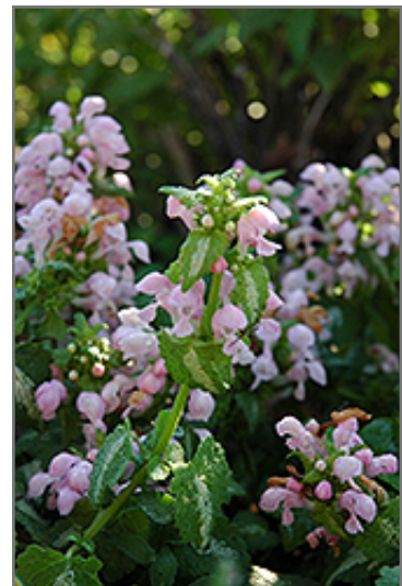
Shell Pink Spotted Dead Nettle flowers