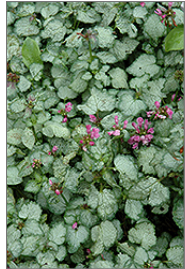
Beacon Silver Spotted Dead Nettle flowers