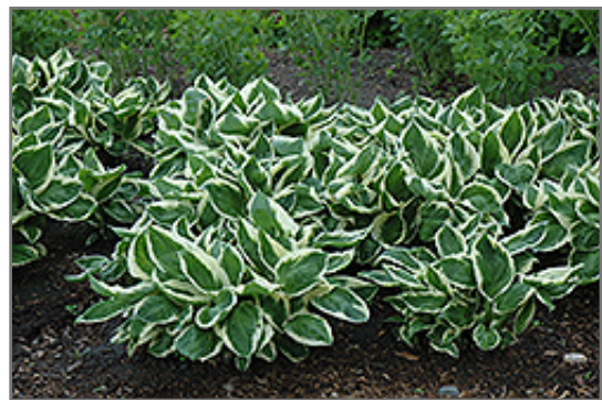
Minuteman Hosta