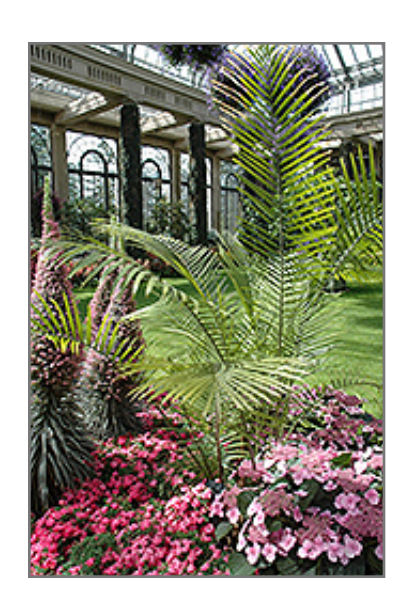
Majesty Palm

When grown indoors, Majesty Palm can be expected to grow to be about 10 feet tall at maturity, with a spread of 5 feet. It grows at a fast rate, and under ideal conditions can be expected to live for approximately 20 years. This houseplant performs well in both bright or indirect sunlight and strong artificial light, and can therefore be situated in almost any well-lit room or location. It does best in average to evenly moist soil, but will not tolerate standing water. The surface of the soil shouldn't be allowed to dry out completely, and so you should expect to water this plant once and possibly even twice each week. Be aware that your particular watering schedule may vary depending on its location in the room, the pot size, plant size and other conditions; if in doubt, ask one of our experts in the store for advice. It is not particular as to soil pH, but grows best in rich soil. Contact the store for specific recommendations on pre-mixed potting soil for this plant.