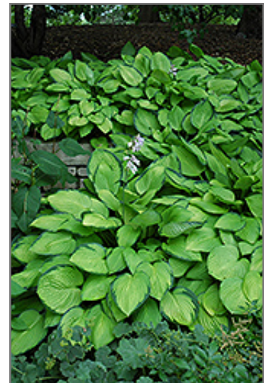
Gold Standard Hosta in bloom