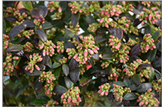
Blueberry Glaze Blueberry flowers

This is a multi-stemmed deciduous shrub with a mounded form. Its average texture blends into the landscape, but can be balanced by one or two finer or coarser trees or shrubs for an effective composition. This is a relatively low maintenance plant, and usually looks its best without pruning, although it will tolerate pruning. It is a good choice for attracting birds to your yard. It has no significant negative characteristics.