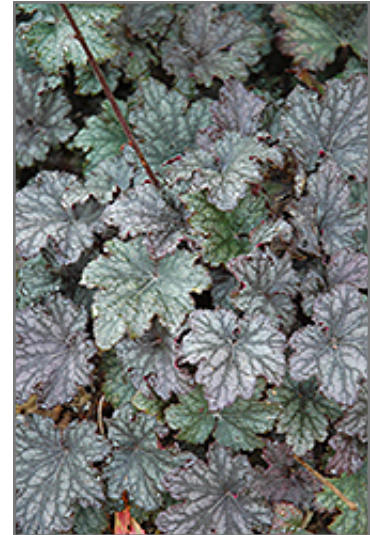
Frosted Violet Coral Bells foliage

This is a relatively low maintenance plant, and should be cut back in late fall in preparation for winter. It is a good choice for attracting hummingbirds to your yard. It has no significant negative characteristics.