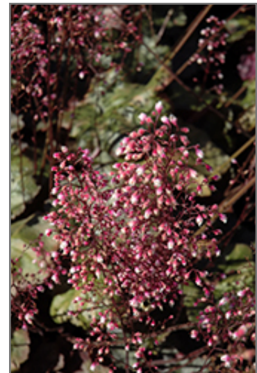
Frosted Violet Coral Bells flowers