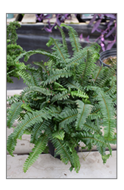
Kimberley Queen Australian Sword Fern in full

When grown indoors, Kimberley Queen Australian Sword Fern can be expected to grow to be about 3 feet tall at maturity, with a spread of 3 feet. It grows at a fast rate, and under ideal conditions can be expected to live for approximately 20 years. This houseplant performs well in both bright or indirect sunlight and strong artificial light, and can therefore be situated in almost any well-lit room or location. It does best in average to evenly moist soil, but will not tolerate standing water. The surface of the soil shouldn't be allowed to dry out completely, and so you should expect to water this plant once and possibly even twice each week. Be aware that your particular watering schedule may vary depending on its location in the room, the pot size, plant size and other conditions; if in doubt, ask one of our experts in the store for advice. It is not particular as to soil pH, but grows best in rich soil. Contact the store for specific recommendations on pre-mixed potting soil for this plant.