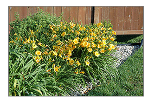
Stella de Oro Daylily in bloom