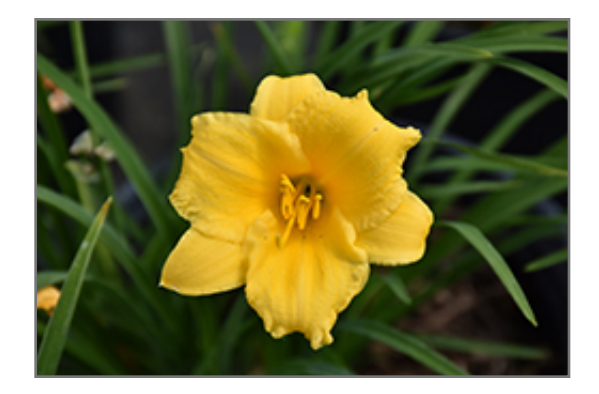
Stella de Oro Daylily flowers