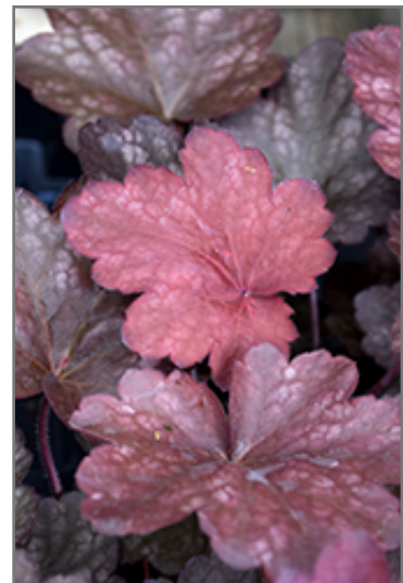
Carnival Candy Apple Coral Bells foliage