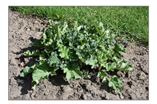
Victoria Rhubarb

This is an herbaceous perennial with a rigidly upright and towering form. Its wonderfully bold, coarse texture can be very effective in a balanced garden composition. This plant will require occasional maintenance and upkeep, and can be pruned at anytime. Deer don't particularly care for this plant and will usually leave it alone in favor of tastier treats. It has no significant negative characteristics.